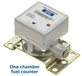
One-chamber fuel counter