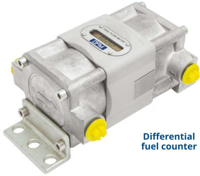
Differential fuel counter

DFM autonomous fuel counters are designed for fuel consumption measurement and operation time monitoring of diesel engines, diesel generators, oil boilers and burners. Results of measurement are shown on LCD display – 17 information screens. Autonomous fuel counters are used as stand-alone solution for fuel monitoring without a need of additional equipment or software.