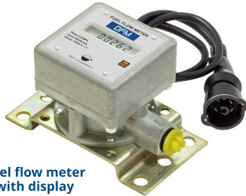
Fuel flow meter with display

DFM flow meter – accurate tool for direct fuel consumption measurement and operation time monitoring of diesel engines, diesel generators, oil boilers and burners. Goals: monitoring of real fuel consumption; preventing fuel theft; fuel consumption optimization; machine hours accounting.