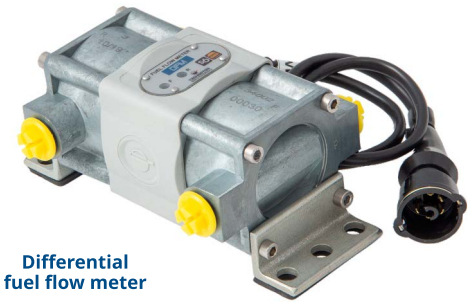
Differential fuel flow meter