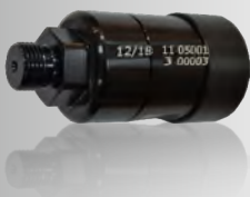
GNOM S7 DDE