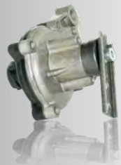
GNOM DP, GNOM DP CAN